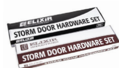
0212038 Hardware Kit for Storm Door - White