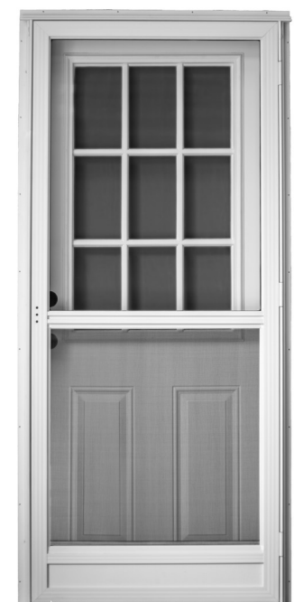
Self-Storing Storm Shown