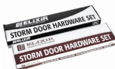
0212036 Hardware Kit for Storm Door - Black