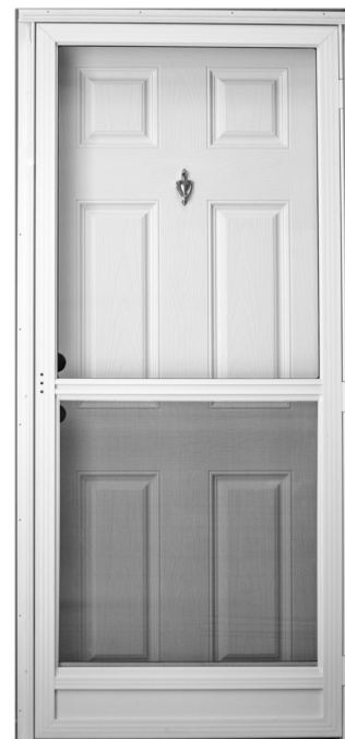
Self-Storing Storm Shown