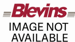
0290116 Entrance Combo Lock with Deadbolt and Mortise Plate - Stainless Steel