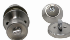
0295127 Combo Lock Set Master Keyed - Stainless Steel