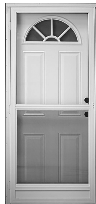
Self-Storing Storm Shown