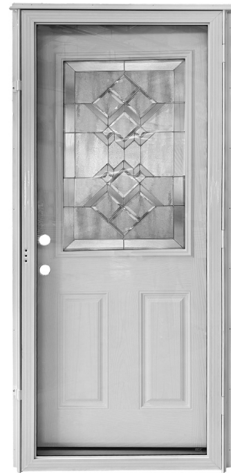
Full View Storm Shown