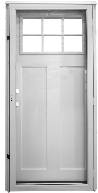
Full View Storm Shown