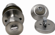
0295126 Adjustable Entrance Combo Lock - Stainless Steel